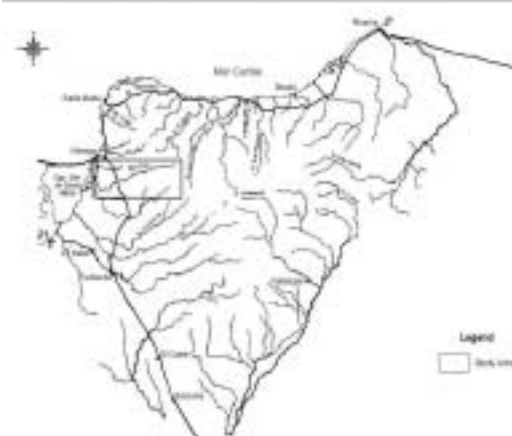
Figure 1. Map of the río Frío valley, Sierra Nevada de Santa Marta, north-east Colombia.

The limits of the Sierra Nevada de Santa Marta National Park are above 2,000 m and the Indian reserve of Kogi-Malayo extends above 2,500 m. Access to the higher parts of the valley, above 2,500 m, were limited during the study period, due to problems with permissions from the indigenous